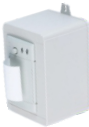
T24-PR1 Wireless surface mounting tally roll printer