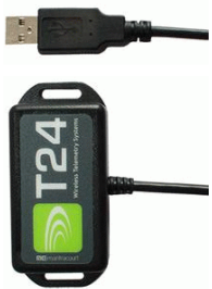
T24-BSu Wireless USB connected base station