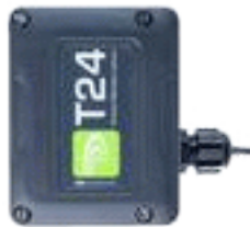
T24-BSue Wireless USB extended range base station