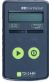
T24-HR Wireless display for connecting to multiple load cells