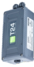
T24-SO Wireless serial ASCII output module