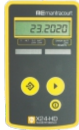
X24-HD ATEX Wireless display for connection to up to 24 load cells