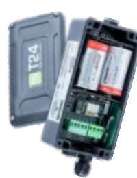
T24-AR Wireless range extender repeater module