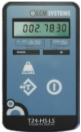
T24-HS-LS Simple wireless display for connecting to 1 load cell