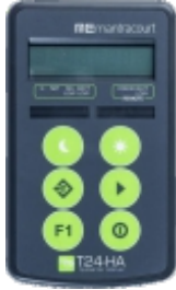
T24-HA Wireless display for connection to up to 12 load cells